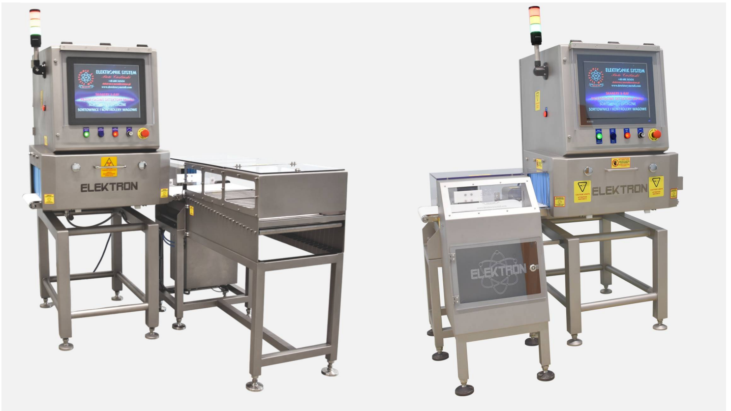
Pusher with roller pallet